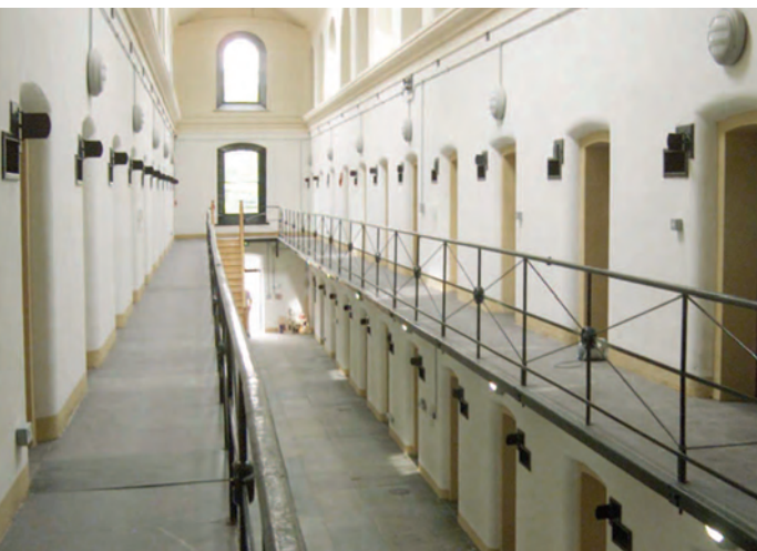
Gaol – following refurbishment