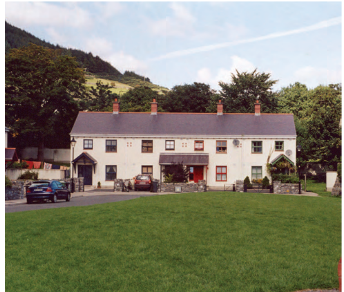
Carlingford Social Housing

The following is a summary of Social Housing construction activity during 2004:-