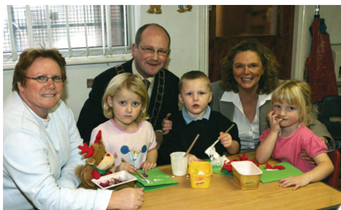
Announcement of funding for Community Childcare Facility at Moneymore