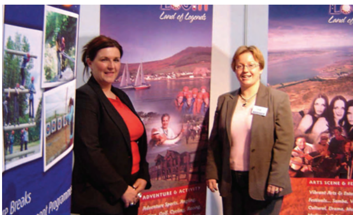
Louth Hospitality exhibit at Holiday World, Dublin

Training provided by Louth Hospitality aimed at product providers and festival organisers will ensure the long term goal of establishing a calendar of events in Louth which will attract visitors during the shoulder seasons.