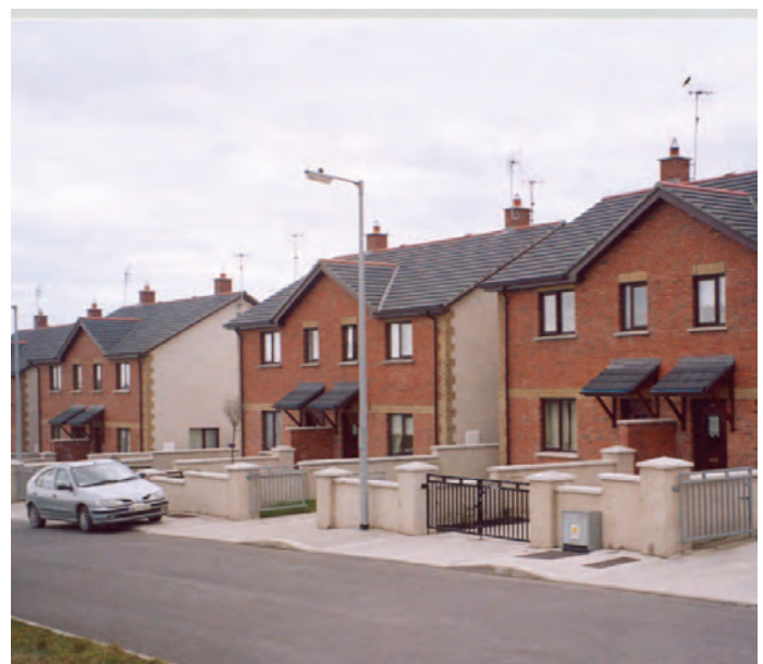
Clogherhead Affordable Housing

Pre-Planning discussions were held with developers of approximately 30 private housing projects during the year with a view to entering into agreements under Part V of the Planning and Development Act, 2000 for delivery of social and affordable housing. While no affordable units were actually delivered under this system in 2004, nevertheless, discussions were well advanced in a sufficient number of cases to ensure finalisation of a number of Part V agreements in the near future. The Council itself also became involved in direct provision of affordable