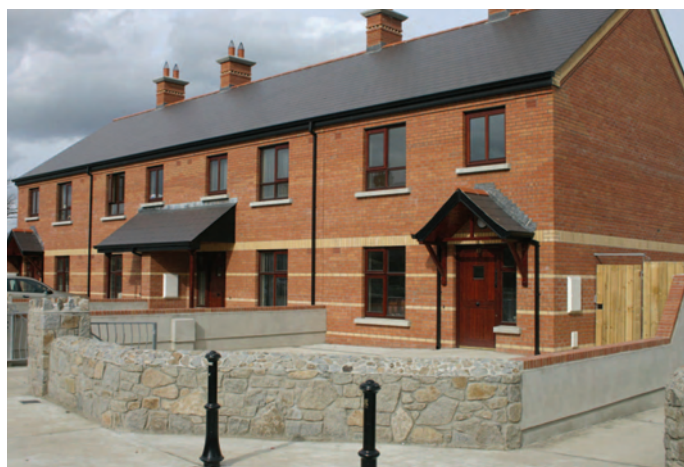
Castlebellingham Housing Scheme