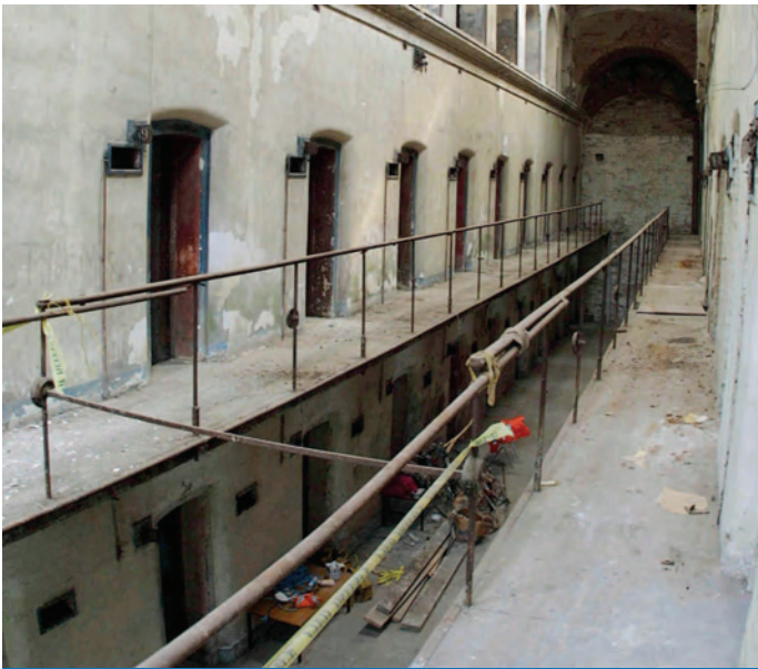
Gaol – prior to refurbishment