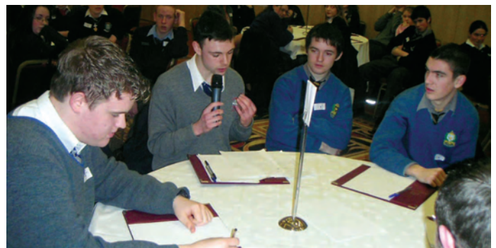
Discussion workshop – Louth Comhairle na nÓg