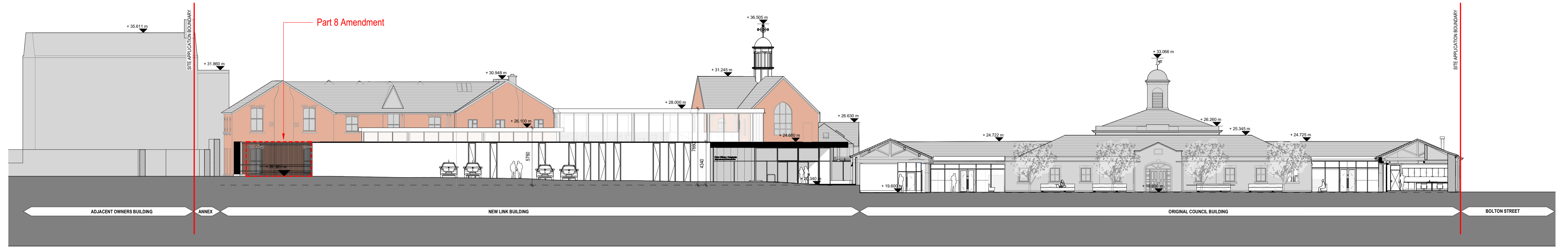
North Elevation (As Granted)