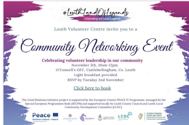
Invitation to the Community Networking Event

The event combined with the presentation of Louth Volunteer Leaders’ Awards. The purpose of this was to showcase how volunteering is valued in our community and to bring a larger base of community groups and members together to reflect on their role in our community. Certificates were presented to the PEACE IV ‘Empowering You’ programme members. This networking event provided an opportunity to showcase the value of PEACE IV projects in our community.