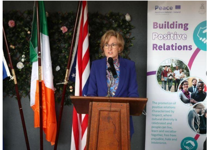
Mairead McGuinness, European Commissioner speaking at the Launch of 'Ardee and The Irish Revolution' publication

This project undertaken by Ardee Heritage Committee was supported by the EU's PEACE IV Programme, which is managed by Special EU Programmes Body and delivered via LMETB.