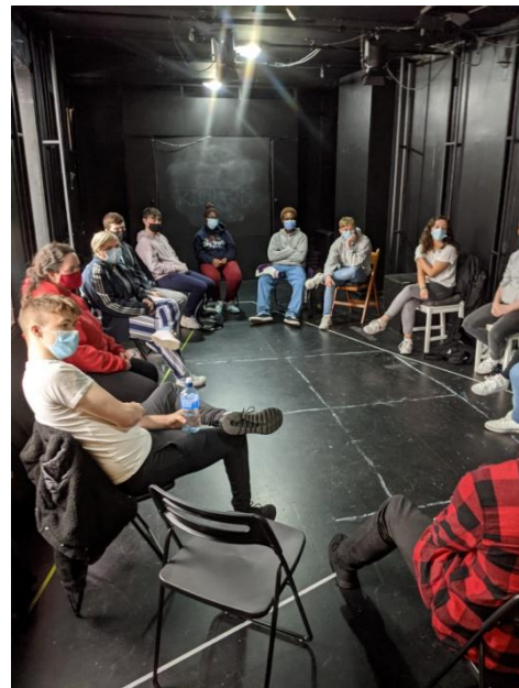
Participants at workshop in The Garage Theatre, Monaghan.

The project targeting 100 young people (aged 12-18 years old) has incorporated a newly devised educational programme for use in peace building, conflict transformation and reconciliation work. The programme involved participants from Louth, Monaghan, Sligo, Belfast and Carrickfergus. A unique feature of this project involved the setting up of a Young People’s Advisory Group who contributed to the design of the programme and the development of the Aftermath Toolkit Educational Resource Pack. The young people engaged in both online and live workshops, while also experiencing cross community visits, trips to exhibitions and theatre performances. Feedback