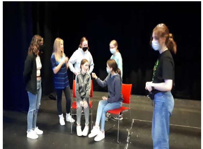
Participants at workshop in The Garage Theatre, Monaghan.

The opening event for the Adapting Aftermath Archives took place on 29 th July 2021. It was a filmed event via YouTube and provided an outline of the programme that will be delivered. 100 young people were involved in the project part of which was delivered by Kabosh Theatre Company using a specifically designed resource toolkit.