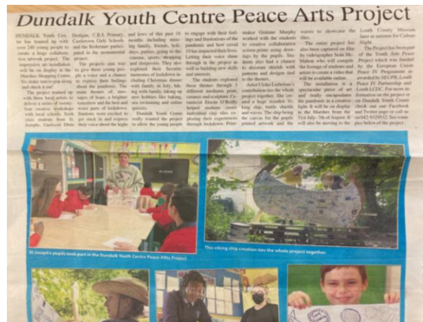
Dundalk Leader 28 th July 2021