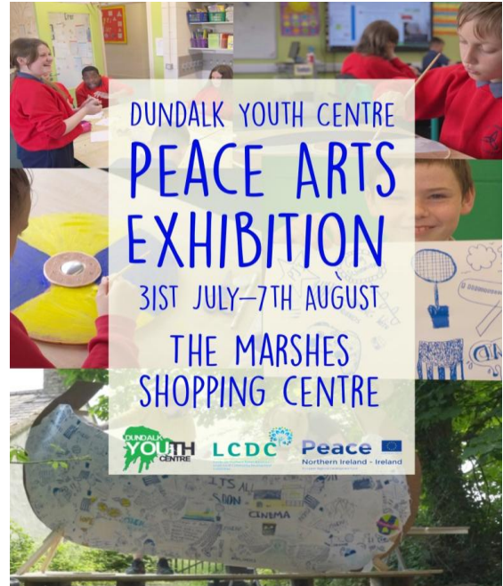
Invitation to PEACE IV – Peace Arts Exhibition