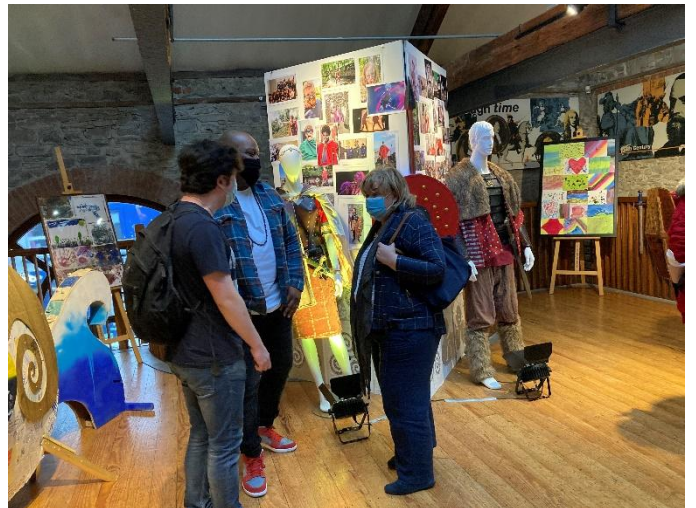
PEACE IV funded project Anticlockwise, Art Fest exhibition on Culture Night 17 th September 2021