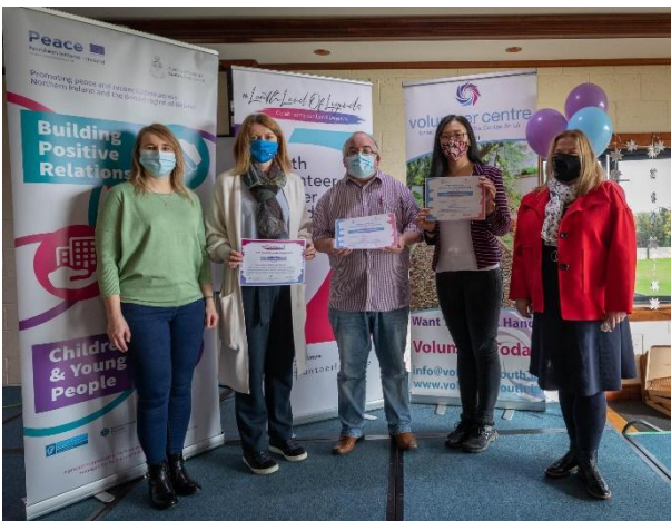
Participants receive their certificates at The Networking Event.