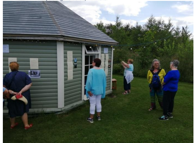
The Women's Group reviewing the stories from the project