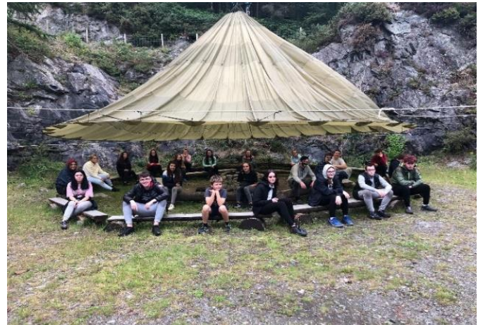
Youths enjoying a day out at Carlingford, Co. Louth PEACE IV funded project Engagement and Signposting Service