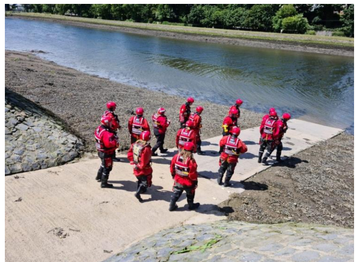
Participants taking part in the Cross Community Rescue and Recovery Skills Project