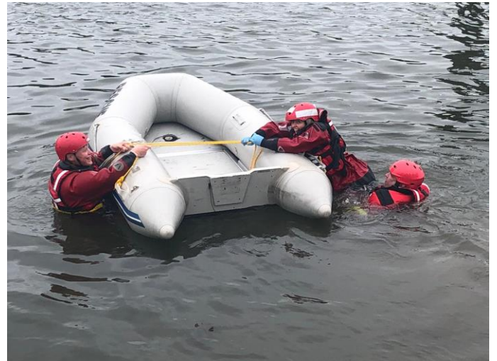
Water Rescue Training