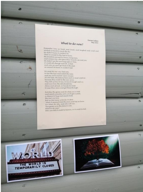
Stories displayed at the Building Bridges Celebration Event.