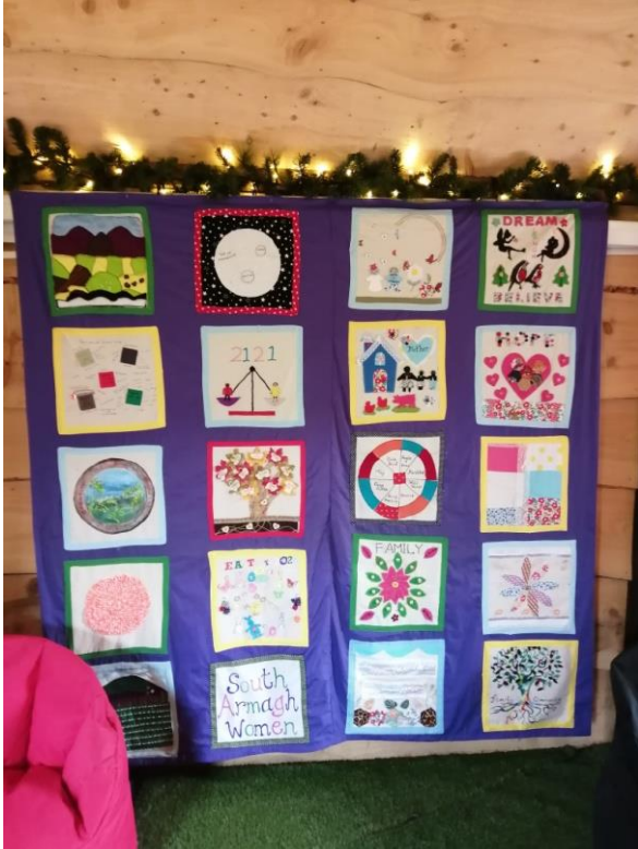
South Armagh Peace Quilt displayed at the Building Bridges Celebration Event