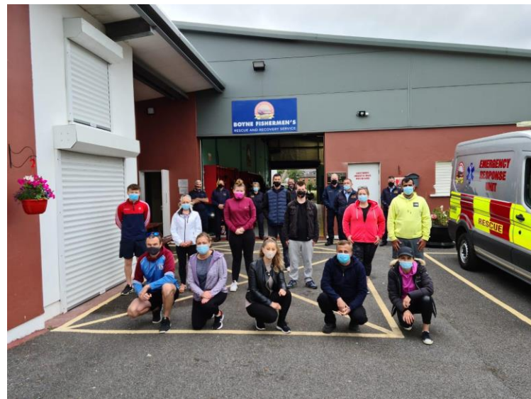
Boyne Fishermen's Rescue and Recovery Team

Project Outputs: The project aims to address issues regarding how we perceive and expect others not from our own ethnic/religious/cultural/community to perceive us. Therefore building good relations across communities/cultures and religions.