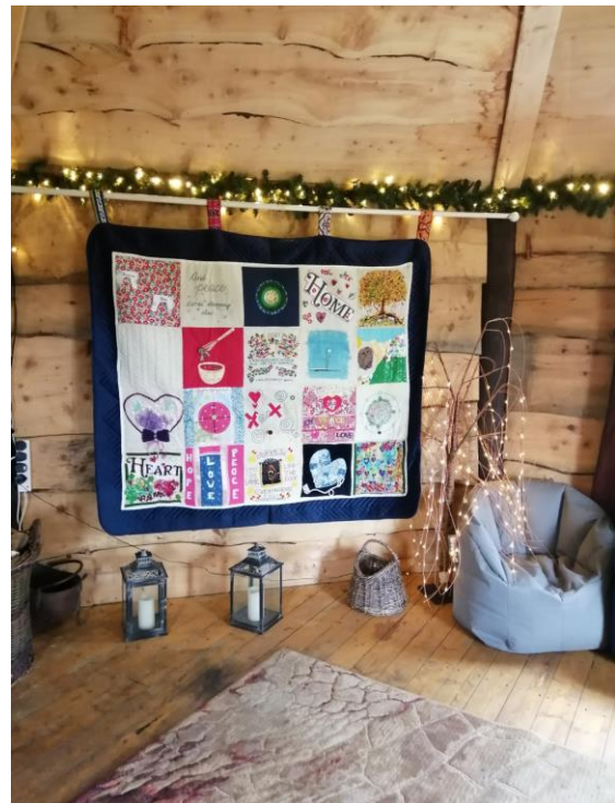
Cooley Connect Well Peace Quilt displayed at the event in Mullaghbawn, Co. Armagh