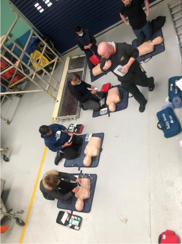
CPR Training taken place at the Cross Community Rescue and Recovery Skills Project funded by PEACE IV