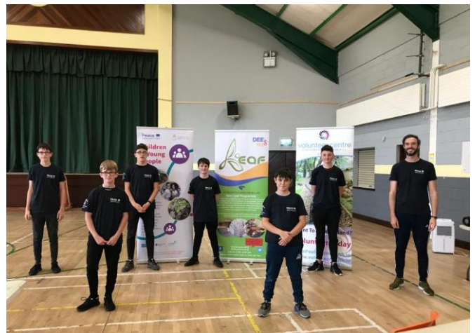
Participants taking part in the Good Relations Initiative Project funded by PEACE IV.