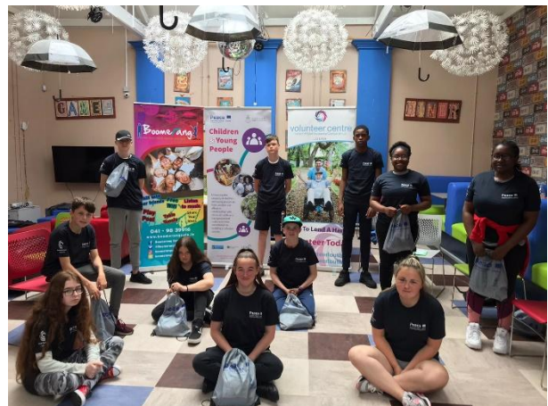
Lifeskills Programme participants –Good Relations Initiative