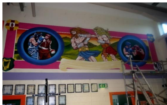
Murals on the wall of Clann Naofa Boxing Club, PEACE IV, Creative Interventions, Muirhevnamor Project.