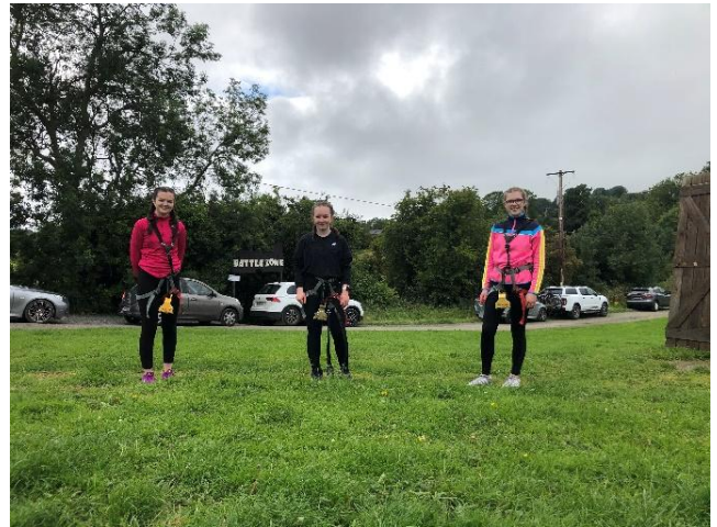
Social day out in Forkhill, Co Armagh as part of the PEACE IV funded project Engagement and Signposting Services.