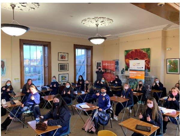
St. Vincents Secondary School students taking part in the PEACE IV funded Creative Interventions Songlines project.