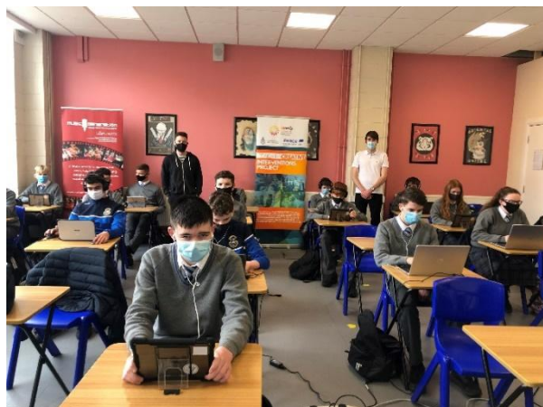
Colaiste Ris students participating in the PEACE IV Creative Interventions, Songlines Project

It is now widely recognised even among the Peace Building community that creativity allows us to move beyond what exists today towards something new and unknowable tomorrow. Creative Interventions aims to develop more than skills, it tries to change young people's thinking by creative output.