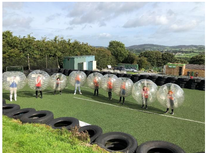
Youths taking part in a social day out in Carlingford, Co. Louth as part of the PEACE IV funded project, Engagement and Signposting Services.

Over the summer months when restrictions were reduced the different groups from the project Engagement and Signposting Services came together for social and cross community events in Forkhill and Carlingford.