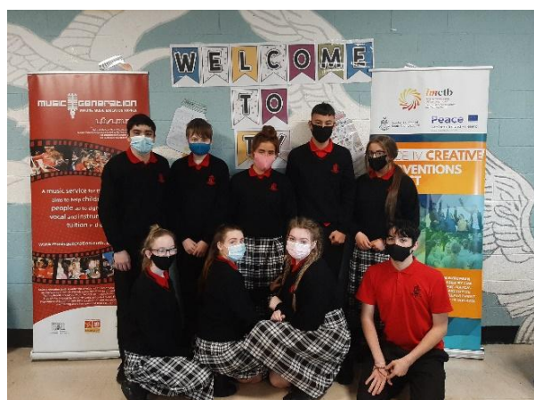
Students from O'Faich College taking part in the PEACE IV funded Creative Interventions, Songlines Project