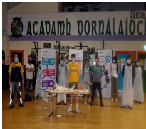
Participants taking part in the PEACE IV, Creative Interventions project at of Clann Naofa Boxing Club

It is now widely recognised even among the Peace Building community that creativity allows us to move beyond what exists today towards something new and unknowable tomorrow. Creative Interventions aims to develop more than skills, it tries to change young people's thinking by creative output.