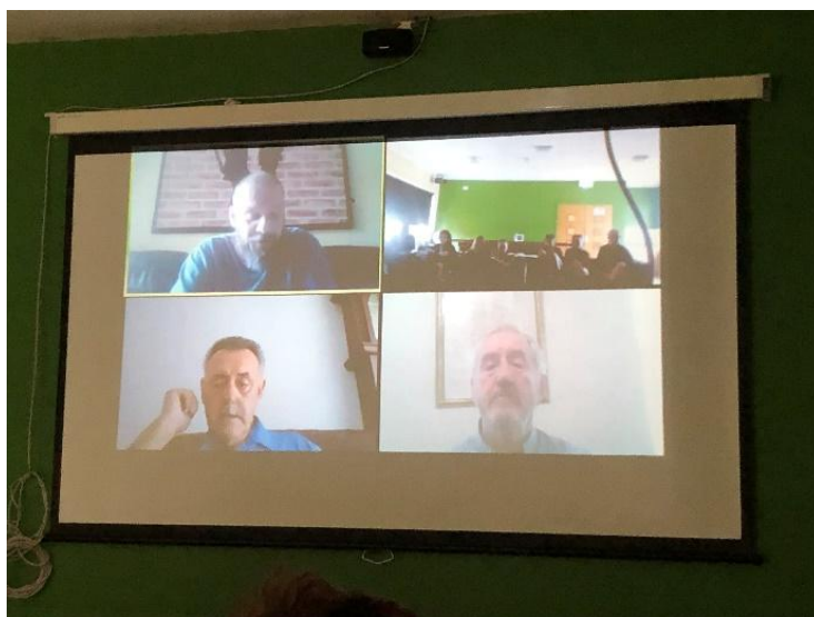
Speakers from Nationalist and Protestant communities engaging with Youth over Zoom as part of the PEACE IV funded project Engagement and Signposting Services