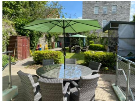
Dundalk Youth Centre Garden.

The PEACE IV projects are supported by the European Union’s PEACE IV Programme, managed by the Special European Programmes Body (SEUPB) and supported locally by Louth County Council and Louth Local Community Development Committee (LCDC).