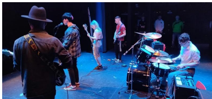
Young people performing at the PEACE IV funded Anticlockwise project at An Táin, Dundalk on 19 th February 2020.