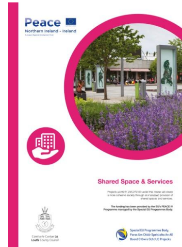
Shared Spaces & Services PEACE IV Poster