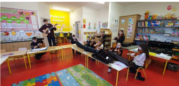
Children enjoying playing their musical instruments while taken part the Reimagining Songs and Music of the Oriel element as part of the PEACE IV funded project “From Oriel To Brexit”

More information on the From Oriel to Brexit project can be found on: