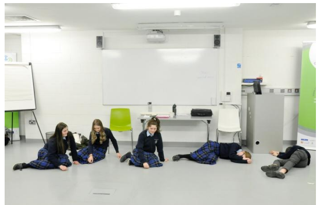
Pupils from The Bush Secondary School enjoying the workshop at Creative Spark.

The latest, and last remaining, phase of the From Oriel to Brexit project is now in place with the commencement in late February of Reimagining Songs and Music of the Oriel - a creative composition project in traditional music involving children from three primary schools located in the Cooley Peninsula - Scoil Naomh Lorcan, Omeath; St. Oliver's National School, Carlingford; Mullaghbuoy National School, Mullaghbuoy.