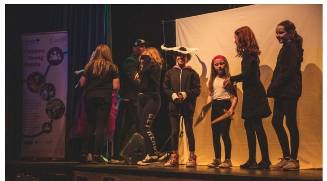
Young children taking part in the PEACE IV funded Anticlockwise project at An Táin, Dundalk