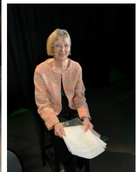
Ladies taken part in the Creative Writing and Photography element of the PEACE IV funded project "From Oriel to Brexit" at University of Ulster on St. Bridgid's Day.