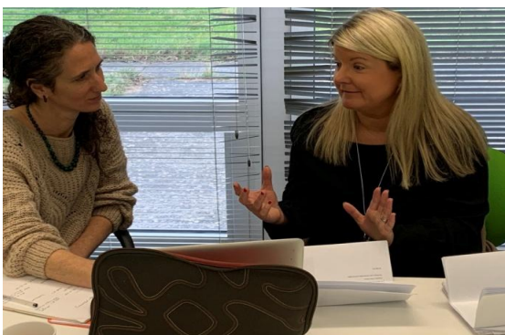
Ladies taking part in the Creative Writing element of the PEACE IV funded project "From Oriel to Brexit" at Creative Spark, Dundalk.