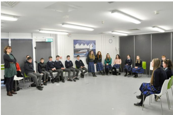
Students from The Bush Secondary School taking part in workshops hosted by Kabosh Theatre as part of PEACE IV funded project “From Oriel to Brexit at Creative Spark.