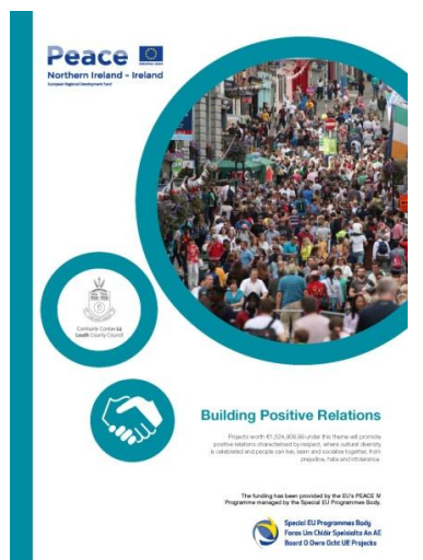
Building Positive Relations PEACE IV Poster