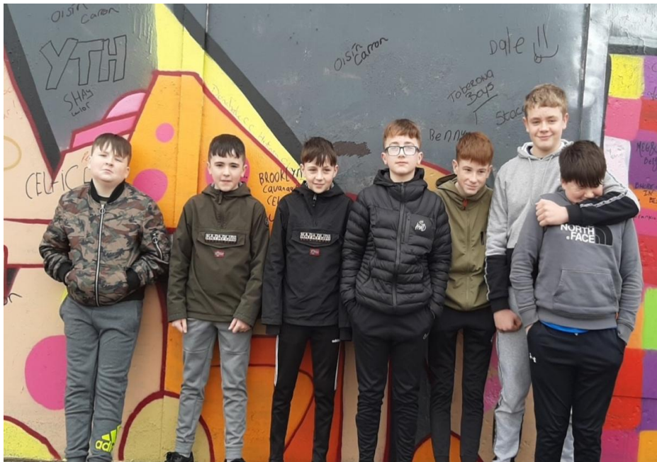
Young boys from Toberona Youth Club enjoying the study visit to Belfast as part of the PEACE IV project Youth Arts Peace Programme

A great day in Belfast was had by all the young people.