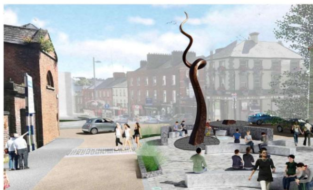
Infinity Spiral – Concept Picture 2