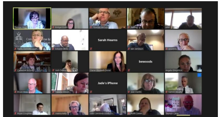
Participants taking part in the closing event of the PEACE IV funded project “Leading the Way” on 9 th May 2022 over Zoom.