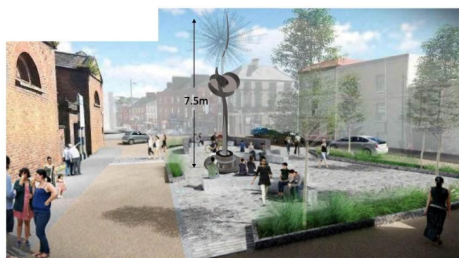
Artwork – Concept Picture 1