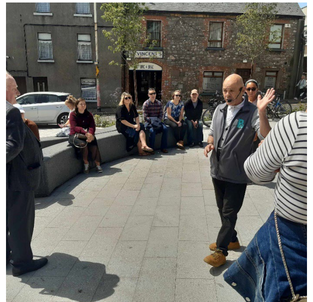
The cross-border walking group at Peter's Hill shared community space.

The space has proven a valuable asset to the town and county and has been used as a meeting space by groups and individuals since its completion. A cross-border walking group event was organised and held in July. This walking tour was in celebration of the different communities and traditions in Drogheda coming together and was initiated at the new Peter's Plaza shared space in the town. The walk took participants through the key historical sites of the town and was attended by members of both the Church of Ireland and Presbyterian communities as well as Roman Catholic communities.