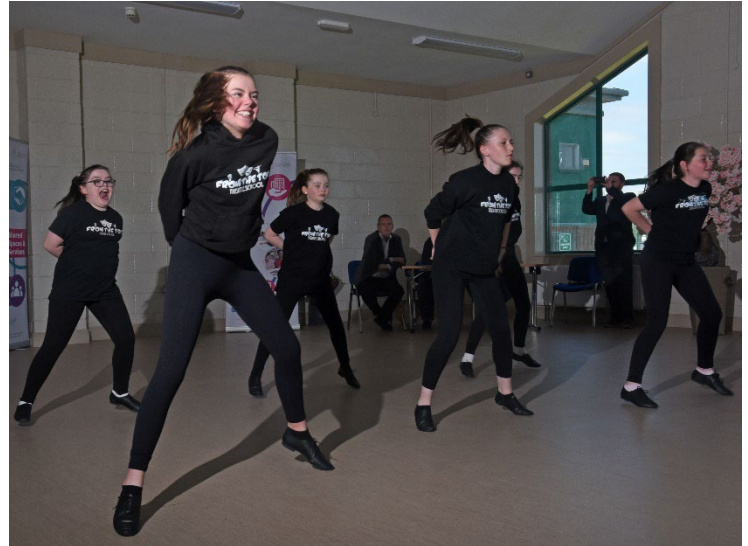
Top Theatre School performing at the Muirhevnamor Community Centre Extension, Dundalk