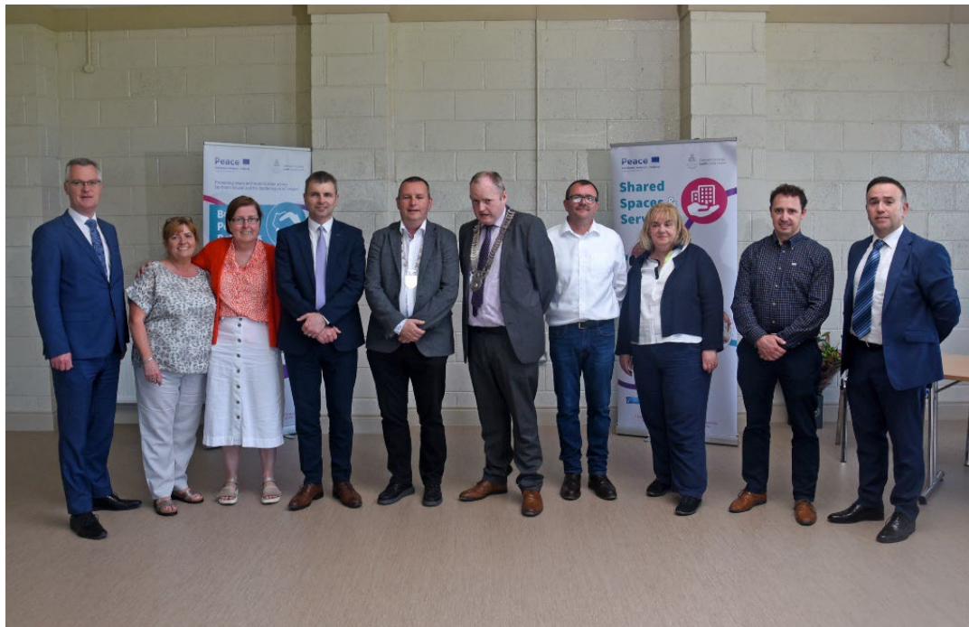
Opening event for the Muirhevnamor Community Centre Extension.