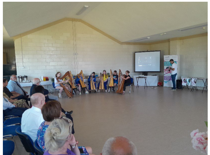
Music Generation Louth students performing at the PEACE IV Closing Event

Our most sincere thanks to everyone who participated in PEACE IV. Go raibh mile maith agaibh.