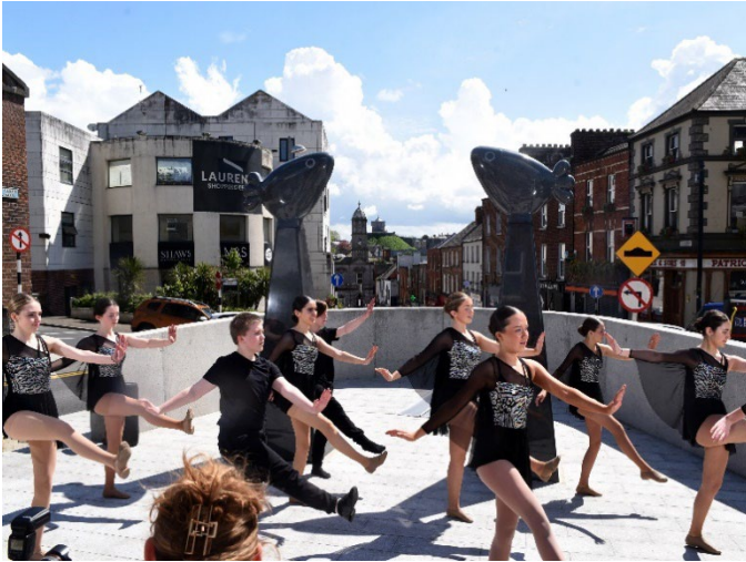
Kidkast performing at the Peter's Hill shared community space opening event.