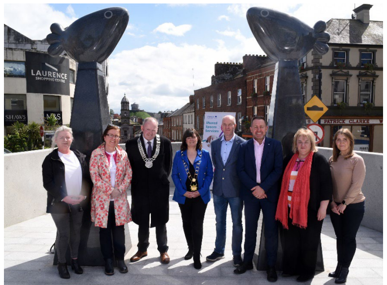
Opening ceremony of Peter's Hill Shared Space.