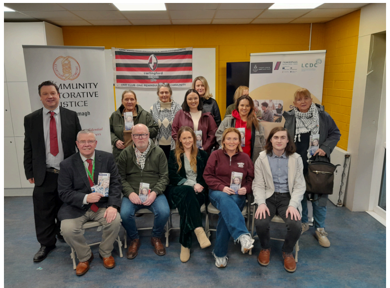
Youth & Community Safety Engagement - Wellbeing & Signposting Programme Launch Event

The launch event for the Youth & Community Safety Engagement - Wellbeing & Signposting Programme was held on the 21 st January in the Foy Centre, Carlingford. This project is being delivered by CRJI Newry/Armagh and will engage 200 young people over 2 years with an aim to support young people living in rural border areas of Louth by delivering a range of youth activities as well as one on one support.