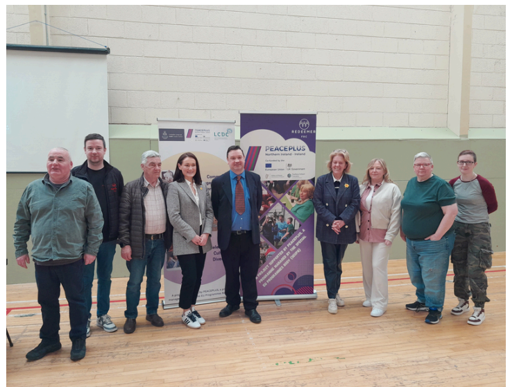
Digital Arts Programme launch Event

The launch event for the Digital Arts Programme was held on the 20 th of March in Redeemer Family Resource Centre Dundalk. This programme, being delivered by Redeemer Family Resource Centre will engage 150 participants to give them the opportunity to engage with and become creatively involved in new and emerging technologies such as gaming and coding, animation, 3d Printing, Design and Digital Fabrication.