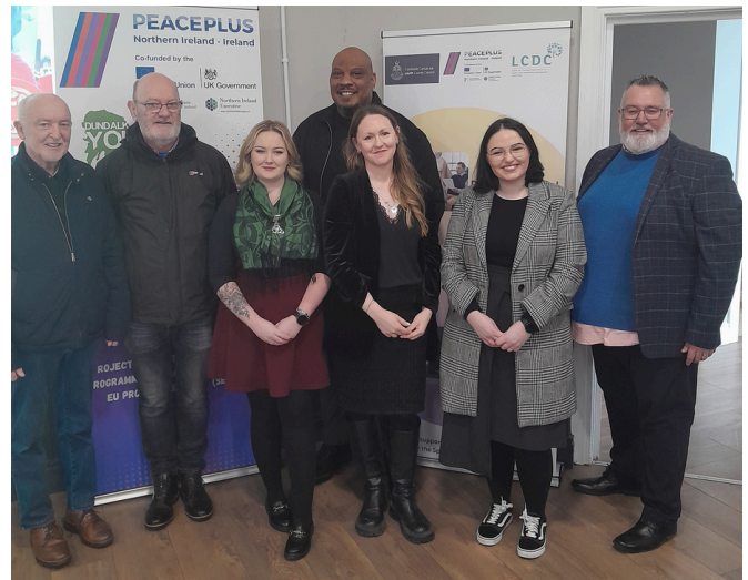
Animating Shared Spaces - Louth Stories Through Art launch Event

This project, being delivered by Dundalk Youth Centre, will engage 300 young people over 2 years with an aim to enhance local people's awareness of their place creating a greater sense of belonging locally.