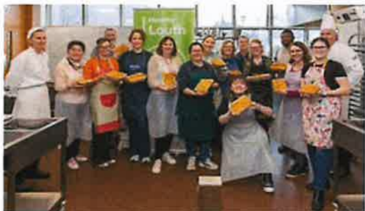
Make One Donate One Breadmaking Workshop

Healthy Louth also attended a Nutritional & Wellbeing Workshop hosted by the DKIT Events, Hospitality & Culinary Arts Department. The event was a great success, showcasing the skill and commitment of Year 2 BA Culinary Arts students who helped deliver an engaging, insightful experience.