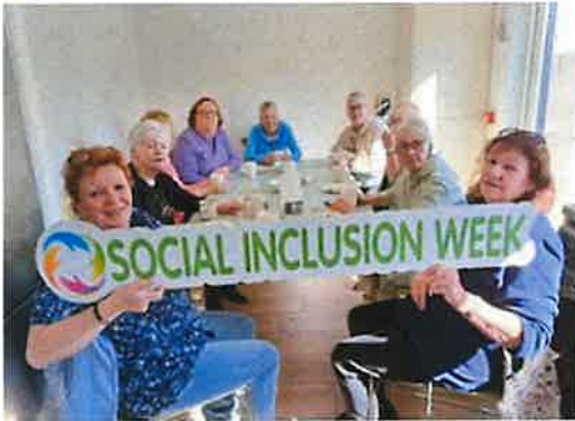
Community House Rathmullen, September 2025