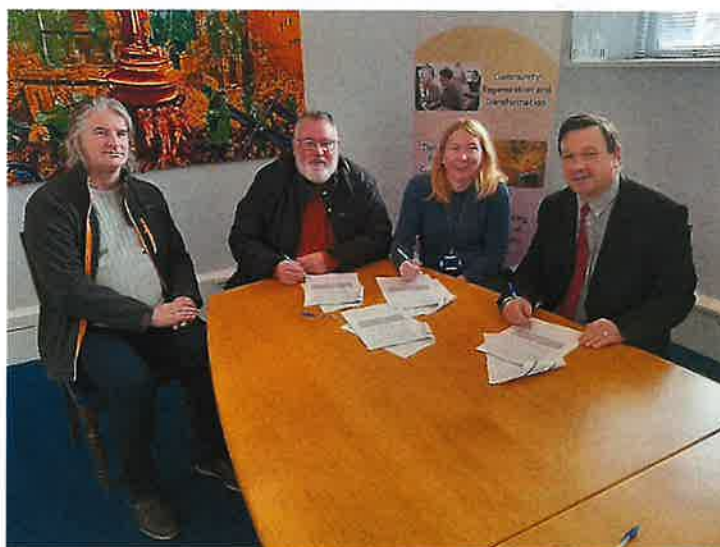
Signing the Youth Leadership and Mentoring Programme contract with Dundalk Youth Centre

Seven other tenders have been assessed by tender assessment boards, approved by the PEACEPLUS Partnership board and ratified by the LCDC.