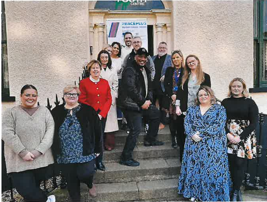
Launch of the Dundalk Youth Centre PEACEPLUS Youth and Sport Leadership Projects

In December 2025 the launch of the 'Youth Leadership and Mentoring Programme' and the 'Young Peoples Outdoor Pursuits and Sports Leadership Programme' was held in Dundalk Youth Centre. These programmes will engage 300 and 80 young people respectively.