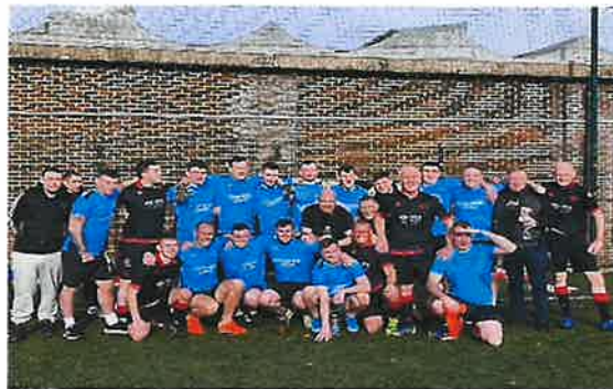
Louth and Coolmine Community Street Leagues