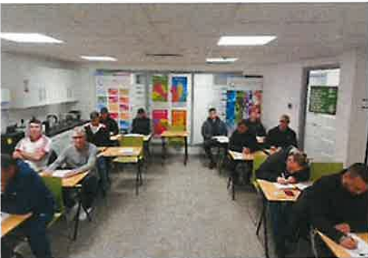
Safe Pass Course, September 2025