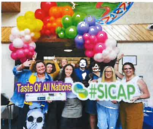
A Taste of All Nations, March 2025