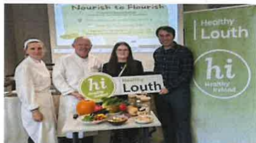
Nourish to Flourish