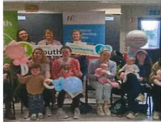
We're Breastfeeding Friendly Support Groups in Dunleer and Blackrock