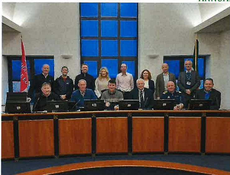
December 2025 Meeting of the Louth County Council / Newry Mourne and Down Strategic Alliance