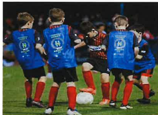
Not Around Us Campaign in Drogheda and Dundalk