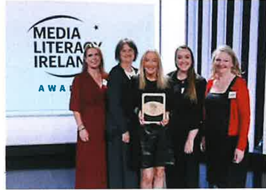
Media Literacy Ireland Awards, October 2025