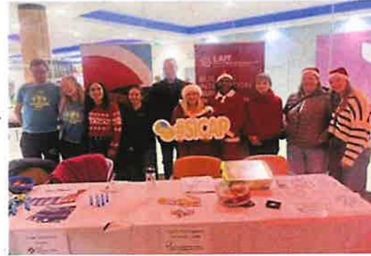
Christmas Around the World, December 2025