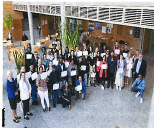
Pathways Graduation, June 2025