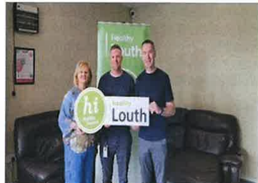
Visits from Rory's Stories and Oisín McConville