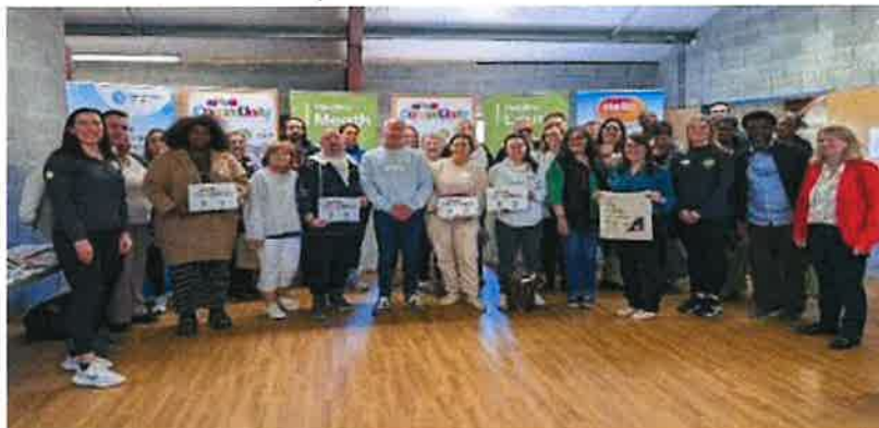
CommUnity Connect Louth & Meath Champions with members of the Project Steering Group

The CommUnity Connect resource, launched at the 2024 Health & Wellbeing Event, continued to expand in 2025. A short survey helped reconnect with champions, capture progress and set priorities for 2026. Two energetic training days were held in May - Day 1 in St. Kevin's Community Centre, Philipstown, and Day 2 in Deerpark Community Hub, Carlanstown. Champions took part in yoga, mindfulness and practical wellbeing activities, and heard from partners including the HSE, Mental Health Ireland, libraries and the PPN. They also explored the 5 Ways to Wellbeing and signed a Memorandum of Understanding. With 16 champions now involved, feedback remains very positive and further collaboration is planned for 2026.