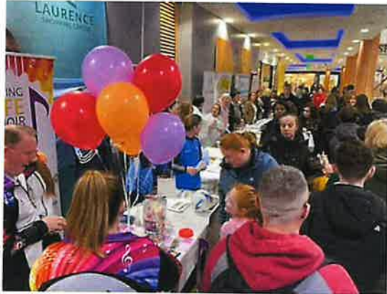
Youth Connect Fest January 2024