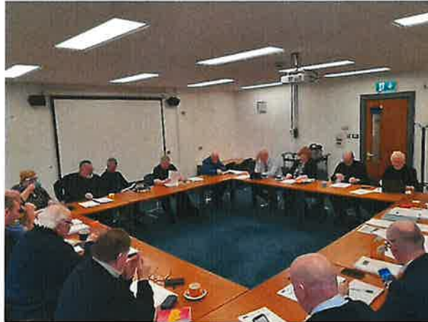
County Louth PEACEPLUS Partnership Committee meeting on 6th February 2024

The Louth PEACEPLUS Action Plan was approved by the Special EU Programmes Body (SEUPB) in October 2024. The final Letter of Offer was received from SEUPB on 28 th November 2024 and the acceptance was signed and returned by Louth County Council on 16 th December 2024.