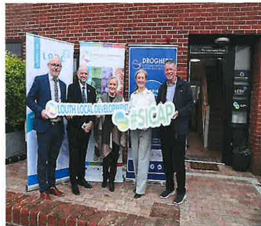
Rathmullen Community House, Drogheda, Officially Opened 24 th October 2024