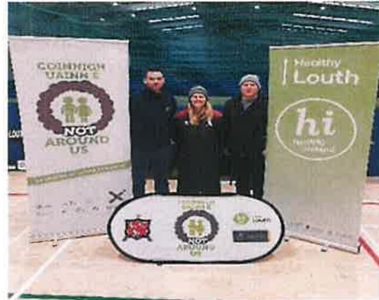
'Not Around Us' Campaign