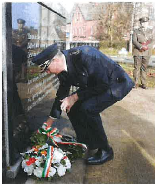
Wreath Laying Ceremony at the PEACE IV War Memorial in Dundalk

There was a wreath laying ceremony and event held at the PEACE IV Shared Space, the Dundalk War Memorial. This demonstrates continued and sustained use of the site as a Shared Space and reflects the value of the site for the town and communities.