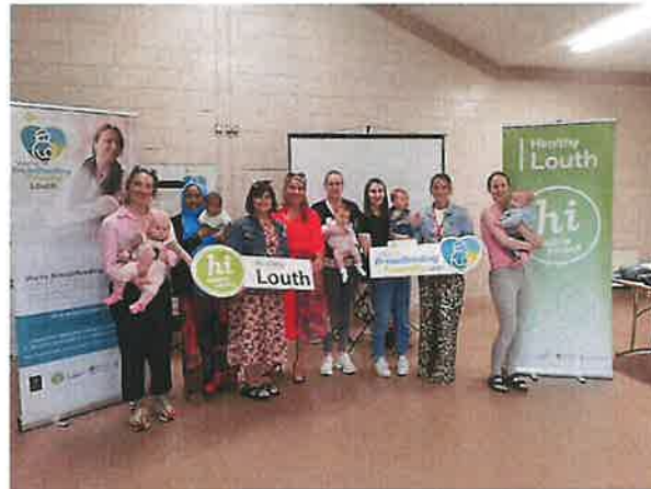
'We're Breastfeeding Friendly Louth' Campaign