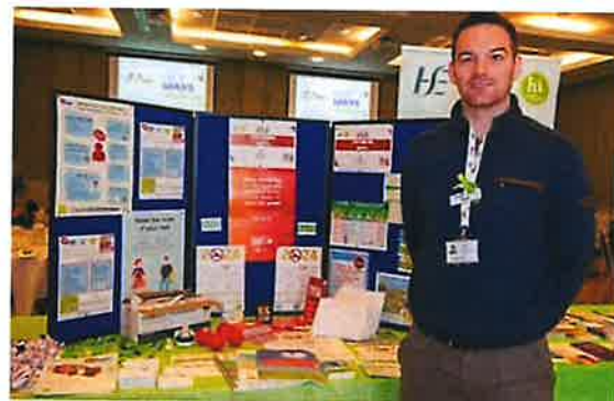
'The Five Ways to Wellbeing: Opportunities for Community Health in Louth' Event, Fairways Hotel, Dundalk