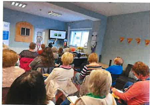
Digital Cafe, Smarter Living for Older People Ardee October 2024