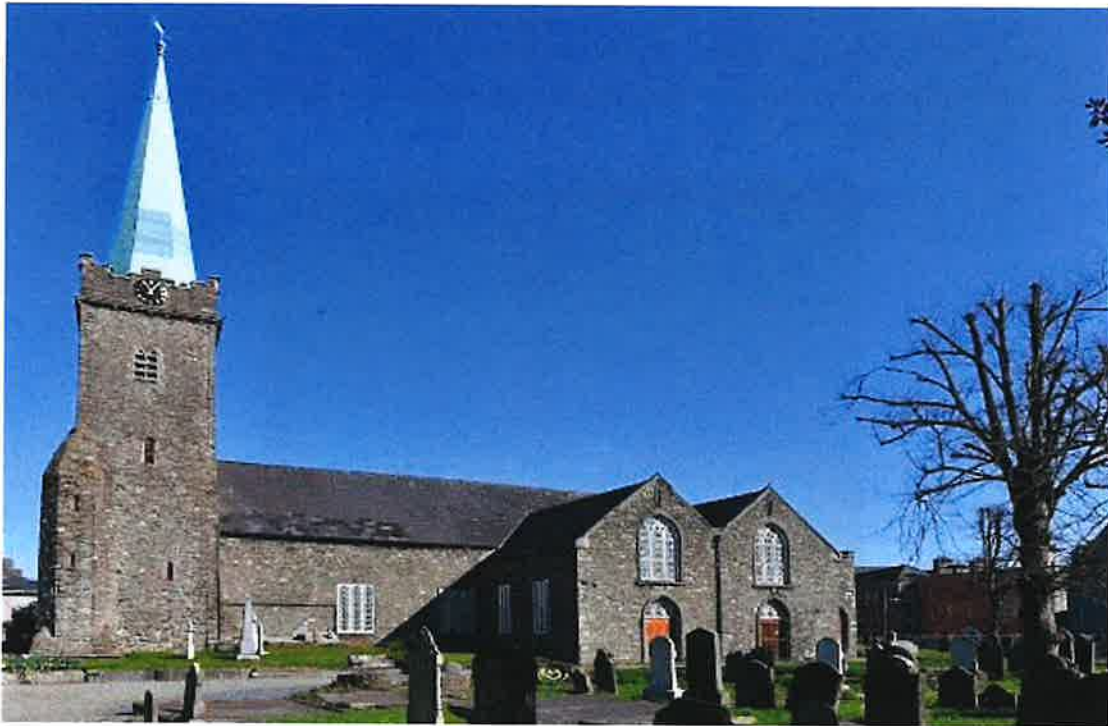
Saint Nicholas Church of Ireland, Dundalk