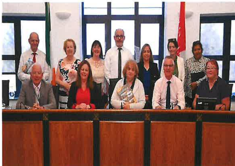
Members of Louth LCDC and the Economic SPC at the launch of the Louth Local Economic & Community Plan 2024-2029

The plan ensures continuous adaptation and monitoring, updating every two years to reflect progress and emerging policies