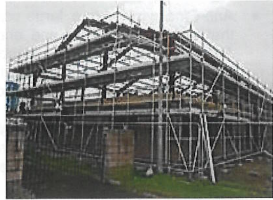
St. Fechin's Centre, Termonfeckin