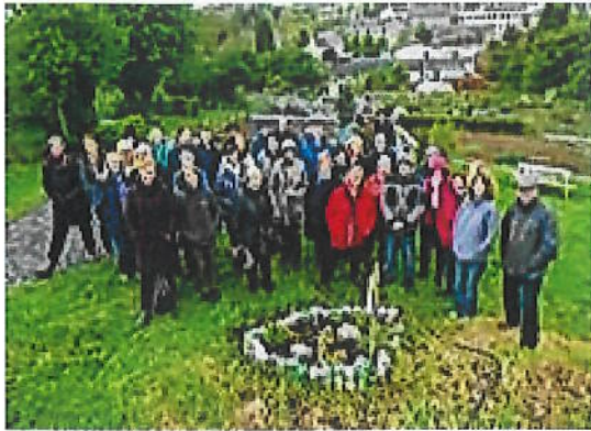
Bio Diversity Training Day