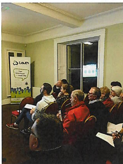
PPN meeting in mid Louth

During 2019 the LCDC provided oversight in the allocation of funding across various funding programmes.