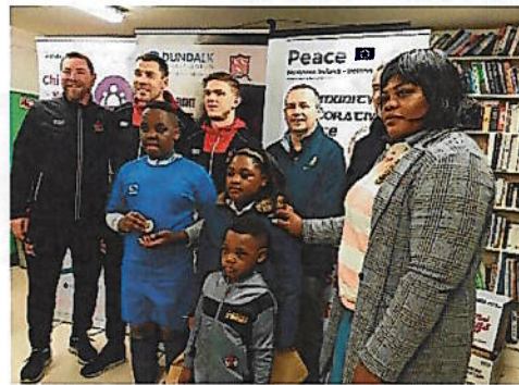
Muirhevnamor Peace Programme