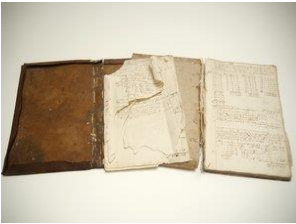
Leather and first section removed