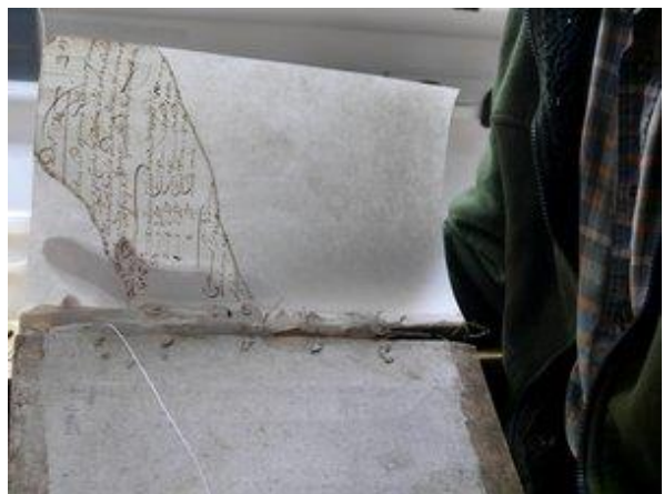
Sewing repaired section back in