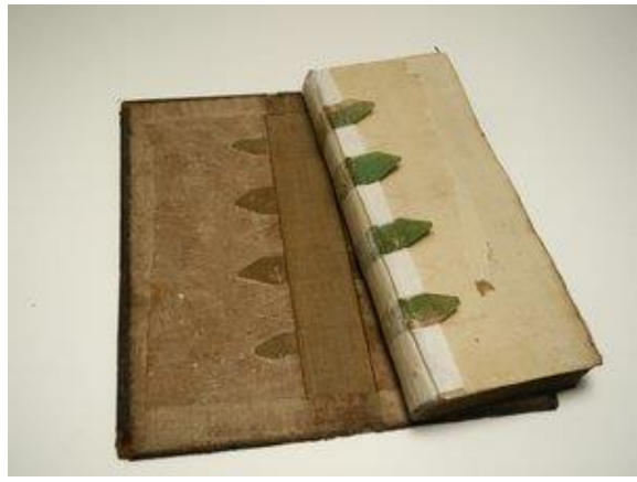
Cover and text-block before re-joining