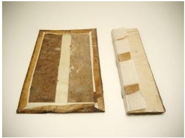
Cover and text-block before re-joining