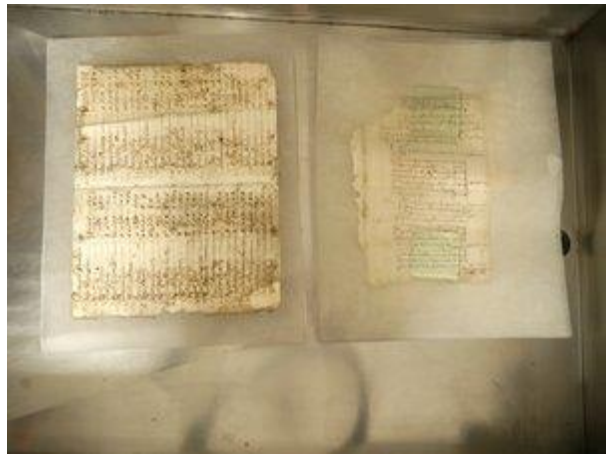
Washing sections in water