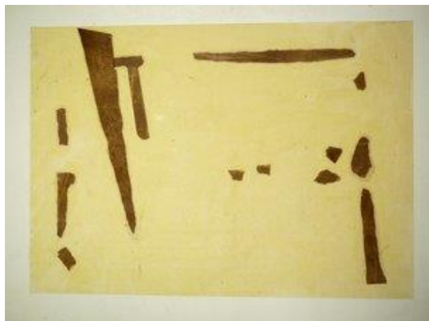
Lining paper with parchment patches