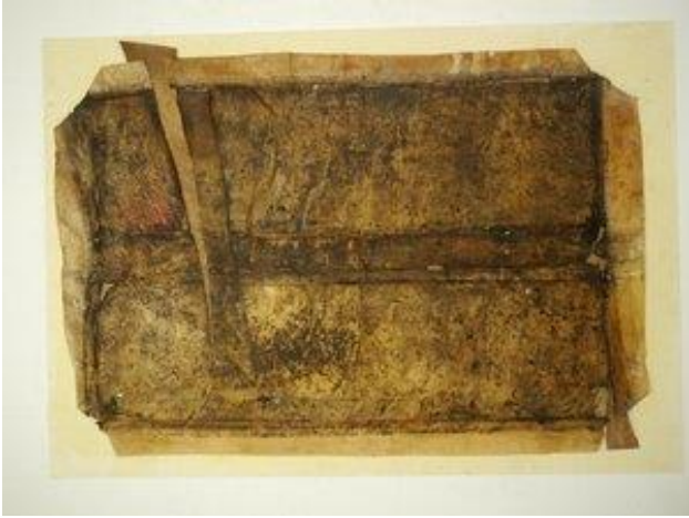
Parchment cover on lining paper