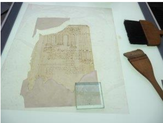
Manual paper repairs