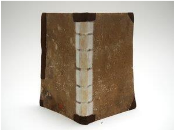
Leather repair patches