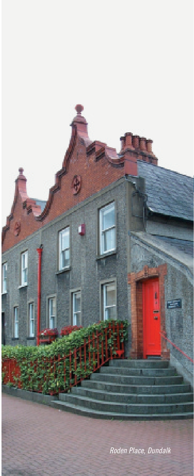
Roden Place, Dundalk

The special character of these areas does not lie in the buildings alone. The historic layout of roads, paths and boundaries, mix of uses, gardens, parks and greens, trees and street furniture, landmarks and views all contribute to the special sense of place.