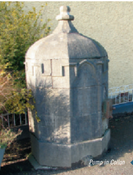
Pump in Collon

Yes. When the development plan for your area is being reviewed it is advertised in the newspapers and the plan will be on public display. You can send your comments to the relevant Planning Department on all aspects of the plan, including ACAs.