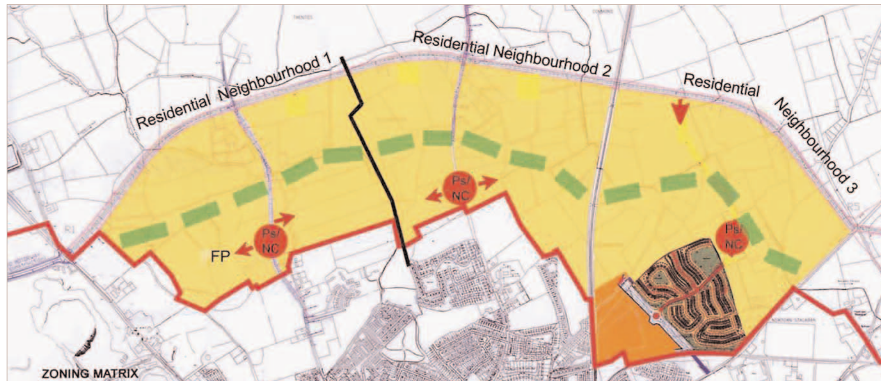
▲ Extract from the North Drogheda Environs Local Area Plan 2004

MAP 2. INDICATIVE TREATMENT OF RESIDENTIAL AREAS NORTH DROGHEDA ENVIRONS PLAN LOUTH COUNTY COUNCIL COUNTY HALL, DUNDALK