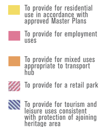
▲ Extract from the North Drogheda Environs Local Area Plan 2004