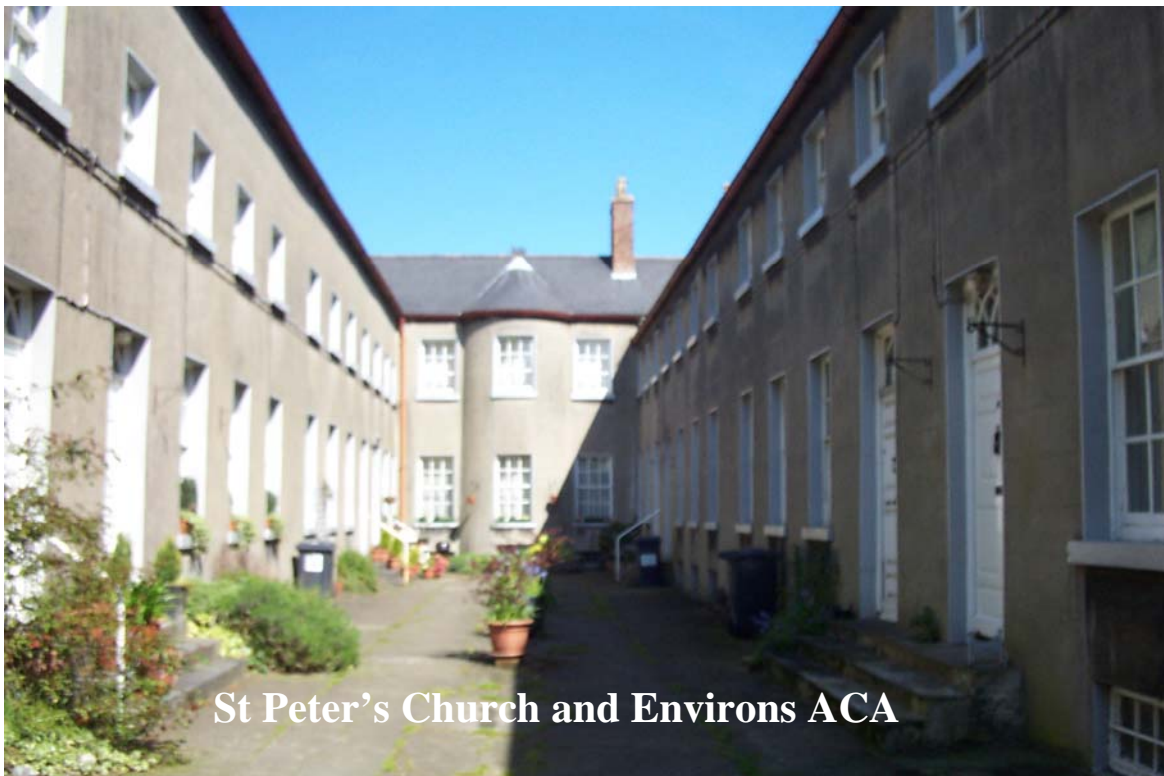
St Peter's Church and Environs ACA

The Planning & Development Act 2000 (Part II, Section 10 and Part IV, Section 81) places an obligation on local authorities to include an objective for the preservation of the character of Architectural Conservation Areas (ACA). An A.C.A is a place, area, group of structures or townscape, which is of special architectural, historical, archaeological, artistic, cultural, scientific, and social or technical interest. They also include areas, which contribute to the appreciation of a protected structure. Piecemeal alterations on individual non -protected structures can have a significant cumulative effect on the streetscape.