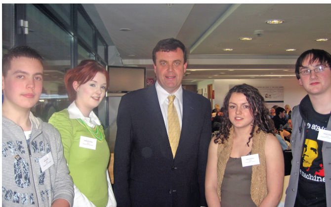
Comhairle na nOg group with Minister Brian Lenihan.