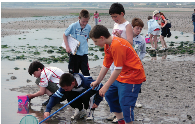
Beach ecology day.

All quarries in the County, except those that were granted planning permission since 28th April 1999, were obliged to register with Louth