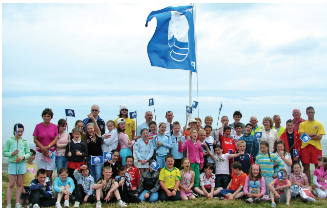
Raising of Blue Flag at Port beach.

The Water Framework Directive encompasses a number of pieces of legislation including the Nitrates Directive, Phosphorus and Dangerous Substances legislation as well as Surface and Drinking Water Quality legislation. Work in implementing these Regulations was ongoing throughout the year with particular emphasis on farm surveys, river water monitoring programme, licensing of trade effluent discharges and inspecting/conditioning Planning Applications.