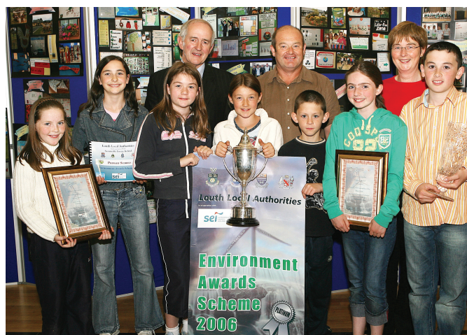
Stabannon National School at Louth Local Authorities Environment Awards.

A complete review of the local environmental programme was undertaken during the year resulting in a change to an Awards based