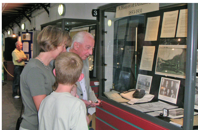
Visitors to heritage exhibition.