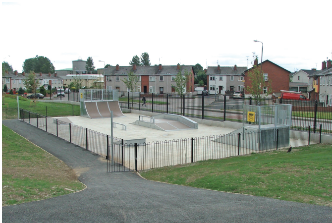
New Skatepark in Dundalk.

New Playground and Skatepark were included in the Aisling Park development carried out by Dundalk Town Council. Potential sites for