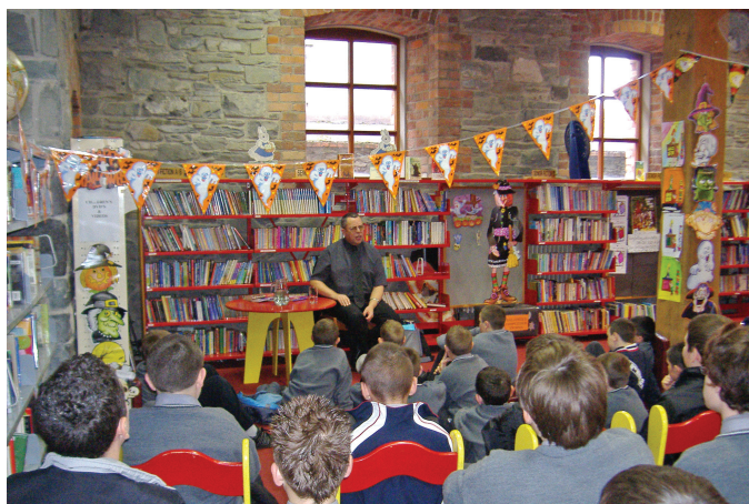
Storytelling in Dundalk Library.

A booksale took place in Dundalk & Drogheda branches in September. In advance of the sale, old and outdated stock was withdrawn. Any unsold stock after the sales was donated to charity, with the Dundalk