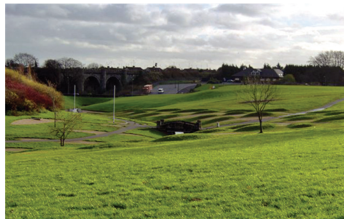
Landscaping of the Glen funded under Drogheda RAPID programme.

Community safety and quality of life have remained key priorities since 2002 and the learning gained from working with communities and agencies which culminated in our local area Seminar in April 2005 has contributed to a very positive relationship with An Garda Síochana and the establishment of a pilot Joint Policing Committee in Drogheda. Infrastructural initiatives supporting community safety and policing activity in RAPID areas involved a successful stage two application for CCTV and subsequent installation of cameras strategically located to impact on five areas located north and south of the town. Alley gating where deemed suitable is now a mainstream activity in RAPID areas involving detailed consultation and signed agreements with tenants.