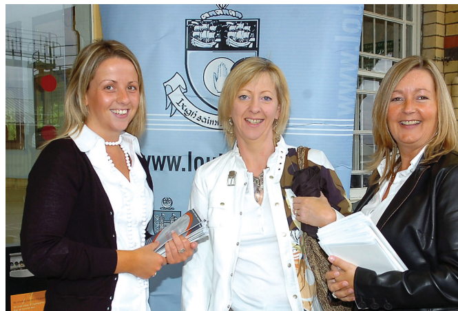
Electoral Register campaign at Dundalk Train Station.