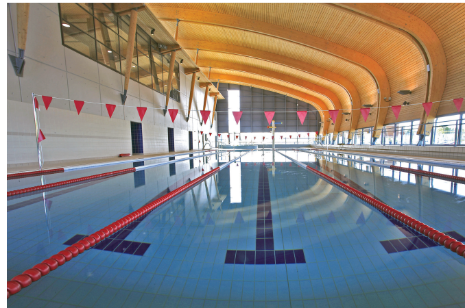
Drogheda swimming pool.

Drogheda Leisure Centre, which incorporates a 25mx 5 lane swimming pool, was opened for public use in May 2006. This Centre situated at Marley's Lane, also includes a health spa, sauna and fitness suite with gym/aerobic studios.