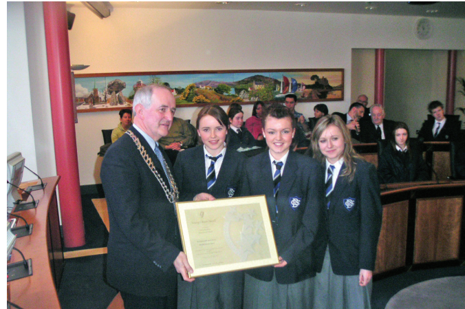
Young Citizens Award.

The Young Citizens Award honoured people who have made a