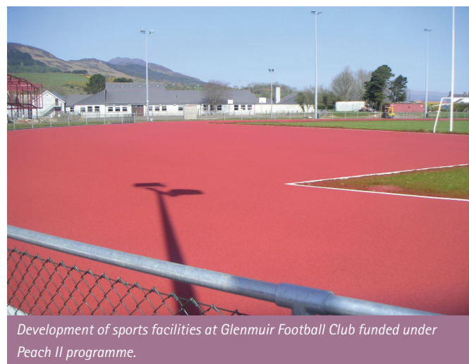
Development of sports facilities at Glenmuir Football Club funded under Peace II programme.

In 2006 a total of €556,470 of Peace II Extension budget has been drawn down by the Project Promoters. This is set to continue in 2007. In 2002 under the original Peace II Programme 2002 – 2004 funding