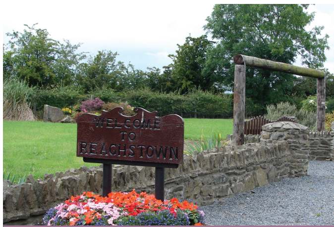
Tidy Towns – Reaghstown.

Drogheda received a tremendous boost to its Tidy Towns Campaign with the announcement that it received an endeavour award for a 12.9% improvement in their marks on the previous year. This recognised the efforts made by both residents and Drogheda Borough Council in making environmental improvements to the town. The judges praised the initiatives taken in blending the past with the present in the built environment and were impressed with the landscaping and maintenance of the green areas around the town. In order to ensure that Drogheda continues to improve, a Tidy Towns Committee was established at the end of 2006 in order to ensure that all sectors of the community are involved in improving the appearance