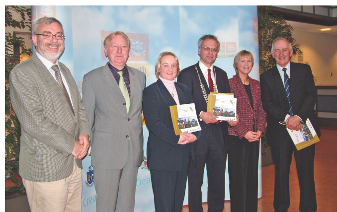
Design and Conservation Awards.

On 3rd May 2006, Louth County Council became the second county in Ireland to launch an award scheme to encourage and reward good