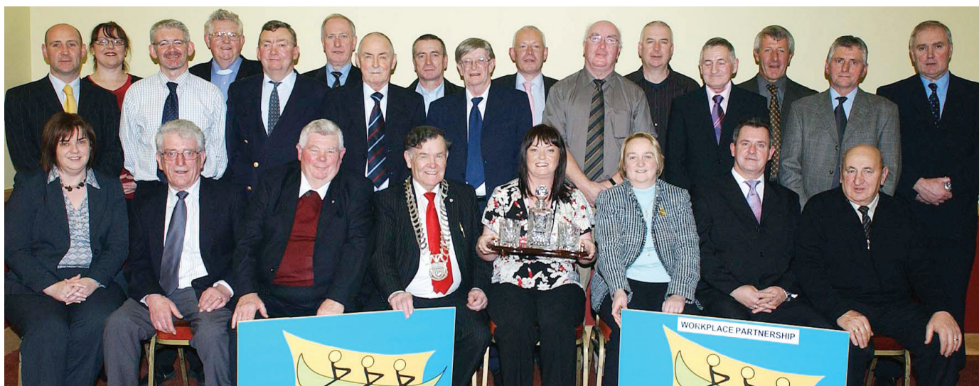
Partnership – Retirement Awards.

Workplace Partnership continued to make steady progress in Louth County Council, Dundalk Town Council and Drogheda Borough Council in 2006. Through Workplace Partnership significant progress is being made in the development of a modern, efficient and more effective Local Authority System here in Louth Local Authorities.