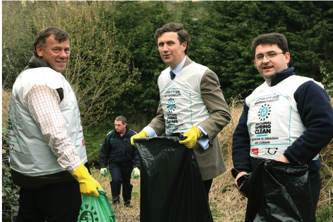
National Spring Clean – Dunleer Traders.