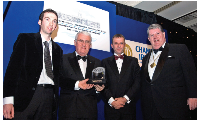
Dundalk Town Council RAPID co-ordinator receiving award for Local Development Training initiative.

Two local task groups are assisted in their work by the Dundalk RAPID Co-ordinator and have a significant role to play in tackling social exclusion in Dundalk. The Dundalk Drugs Advisory Group was established under the auspices of Dundalk Town Council. This multi agency group, through a workshop held in December 2006 have identified a number of actions to tackle the issue of drugs misuse in Dundalk under the headings of treatment, education and prevention, aftercare and research. The advisory group is now in implementation phase. Equally, the social inclusion working group of the Dundalk Economic Development Group has progressed a number of actions in 2006 including targeted employment related training initiatives, initiatives targeting early school leaving and preliminary work to develop an access programme to DKIT for students from socio economic disadvantaged backgrounds.