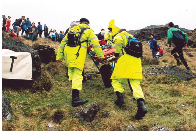
Civil Defence multidisciplinary exercise.

The overall winner of the Peter Rice Award was DKIT for the superb architecture and design of the Nursing Building within the DKIT campus set adjacent to the wind turbine which is reflective of the modern technology and sustainable energy. The award scheme attracted a lot of interest and was deemed a great success.