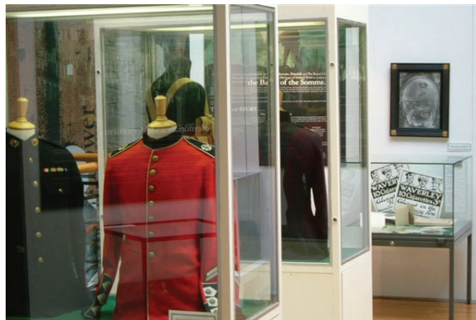
Exhibition on Irish involvement in the First World War at County Museum.