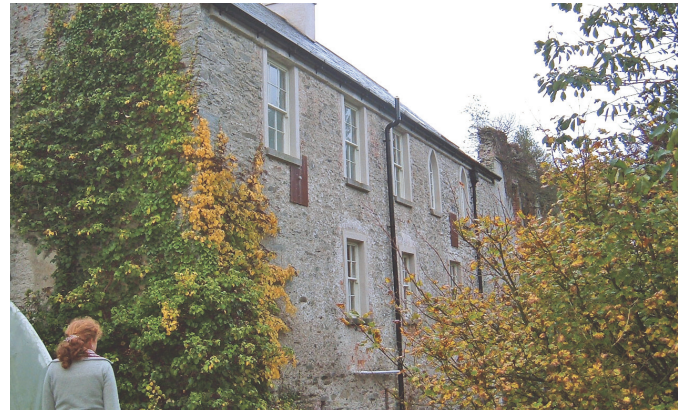
Protected structure – Barmeath Castle.

County Council by 27th April 2005. Section 261 of the Planning and Development Act 2000 provides for the publication of notice of the quarry registration, the opportunity for concerned parties to make submissions/observations, the imposition within a period of 2 years of the registration by the Council of conditions on the operation of the quarry or the modification of previously imposed conditions, and an appeal process for quarry operators. Louth County Council received 12 applications for registration and during 2006 made decisions in the cases of the first two which were registered. The Council is currently in the process of assessing the remaining quarry operations.