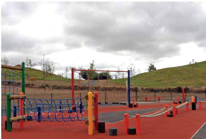
Ashling Park playground.

Skatepark in Drogheda is also being investigated. Play equipment was re-installed at Tower View in Tinure. Further Grant aid secured from Dept. towards provision of Play equipment in Drogheda (Moneymore), Dundalk(Tobberona) and County Louth (Blackrock) area. Sites also tentatively identified at Collon, Dunleer and Tallanstown for further playgrounds.