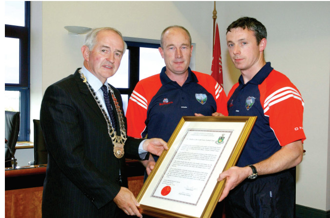
Civic Reception for Louth football team – presentation to Team Trainer and Captain.

registered events ensured our position as one of the top participant in this very important National campaign.