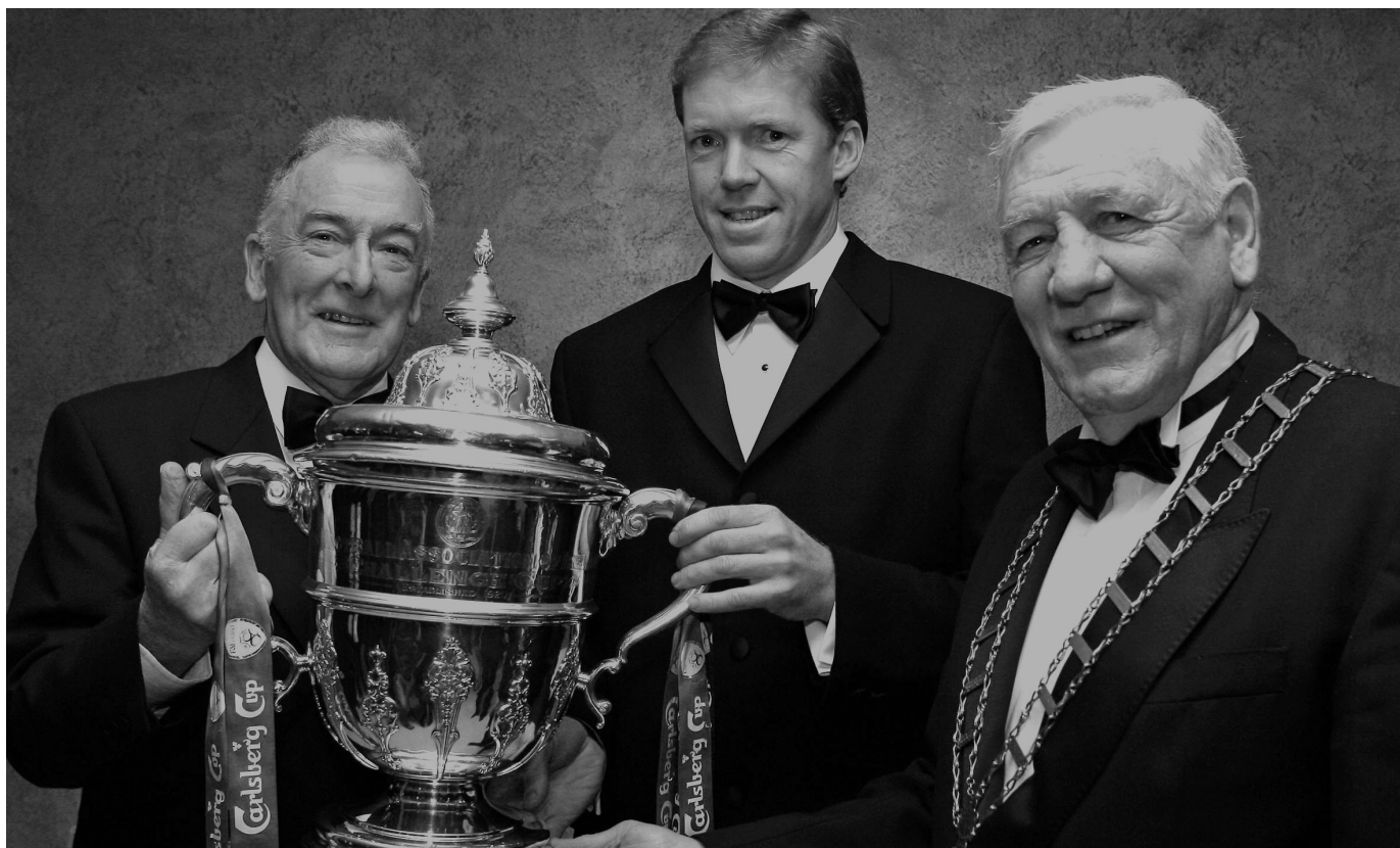
Civic Reception for Drogheda United Football Club.