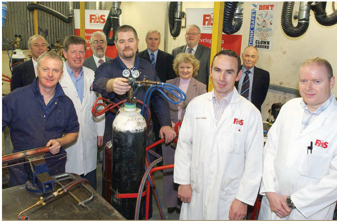
Fas Mature Apprentices Scheme.

Workplace Partnership provides an effective forum in which Management and Trade Unions can have early discussions of a non adversarial type around planned changes, and can also provide a problem solving approach to the handling of the types of conflict that inevitably arises from time to time, around significant organisational change. Experience shows that a stable industrial relations climate and effective and regular management-staff communications can foster an environment in which it is possible to express differences openly and to address them in a problem solving, rather than a conflictual way.