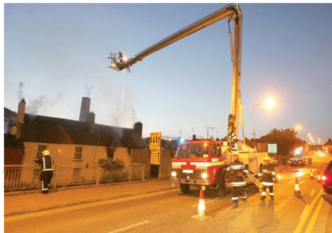
Drogheda Fire Brigade extinguishing fire at Marley's Lane.

2006 was a busy year for Civil Defence in Louth. Classes continued in the various centres around the county. Specialist teams in Technical Rescue, Boat and Kayak trained regularly for call-outs in support of the emergency services. Members were busy on community duties and providing first aid cover at sports events. A specialist Rescue Team