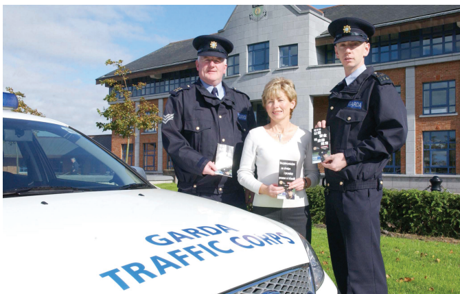
Launch of Road Safety Campaign

The Infrastructural Strategic Policy Committee established a specific Road Safety working group which is facilitated by the Road Safety Officer (RSO). The Committee through the RSO progressed a number of initiatives in 2006 including the successful Seat Belt Sheriff primary schools programme, and a new "Drive for Life" campaign focused at second level schools. In partnership with An Gardaí joint anti collision prevention groups have been revived and those with engineering and enforcement responsibilities are working in conjunction with the educators to improve road safety in the County. Drogheda was chosen to participate in the European Road Safety Audit pilot project. Risk assessments were carried out at the schools in Drogheda in order to establish safety of same. Installations of the appropriate measure were undertaken where safety issues arose.