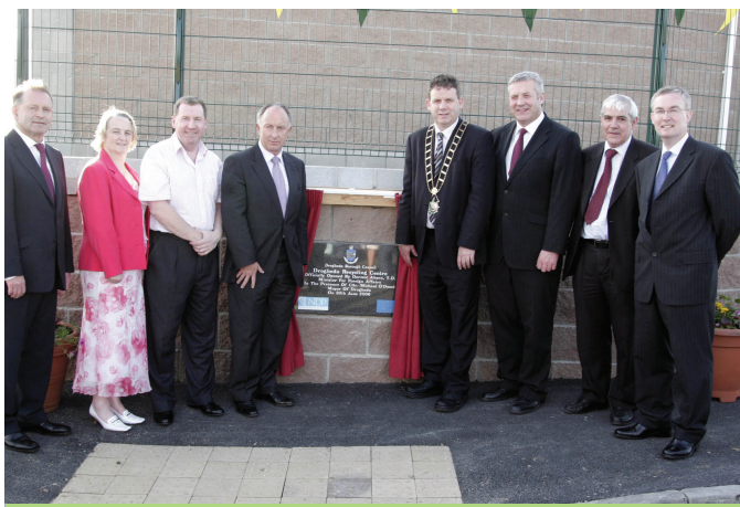
Official opening of Drogheda Recycling Centre.

The Regional Replacement Waste Management Plan was finalised in May 2006 and a number of the initiatives from the Plan will be factored into work programmes in 2007. A Regional Steering Committee met on a frequent basis to co-ordinate implementation of the Plan and such meetings included discussions with service providers to agree time frames and mechanisms for the roll-out of many of the actions contained in the Plan including the introduction of a Brown Bin service.