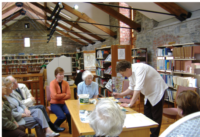
Watercolour masterclass in County Library.

stock going to Liberia with the Irish Army and Drogheda stock being donated to local charities.