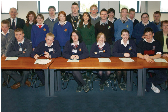
Louth Junior Council.